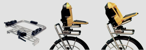
Rotate and Tilt Mounting Table