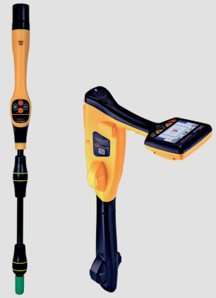
VM-540 and vLoc3-Cam