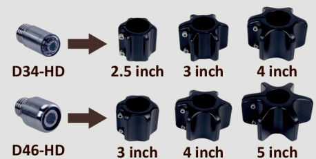
Camera Guide Skirts