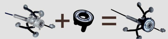
Type-B Adjustable Skid with Light